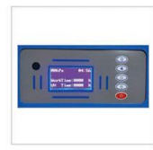
LCD Display Large display is easy to monitor the pressure parameters for work zone and three filters.