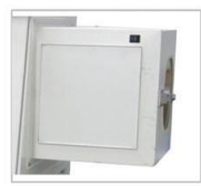
Pass Box Double doors with interlock function and UV lamp.

E-mail: export@biobase.com www.biobase.cc / www.biobase.com