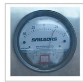
Pressure Meter Display the pressure of work zone.